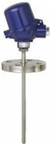
Flanged thermometer with a fabricated thermowell